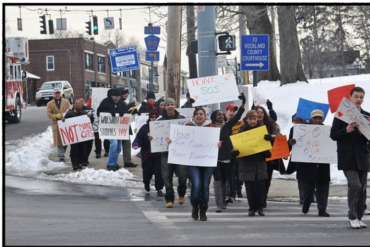
Hudson Valley Action February 24th

At the rally and march we delivered handwritten letters from students, parents, and community advocates from all over the state to demonstrate to Governor Cuomo and Lawmakers that there was widespread opposition to the awful cuts in the budget.