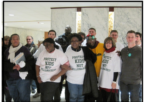
February 15th , Education Budget hearing